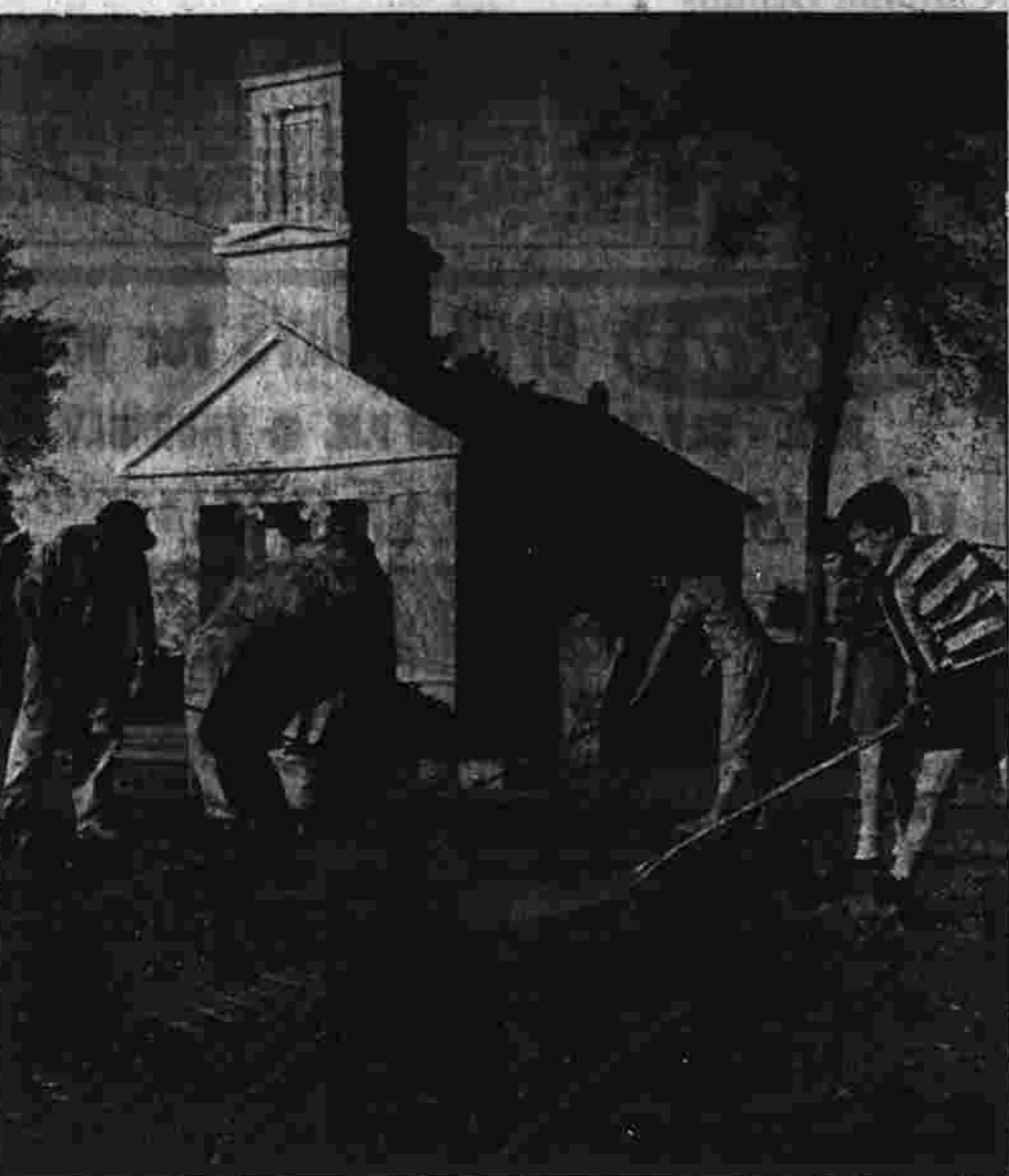
A Raking Party in Bolton